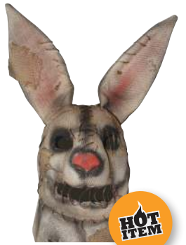
BURLAP RABBIT Mask