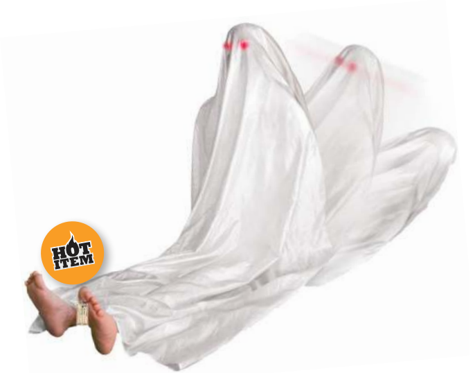
JOHN DOE RISING

No creepy castle or haunted house would be complete without eerie enhancements. Our collection of Halloween decorations will tell your guests they're in for a scary good time!