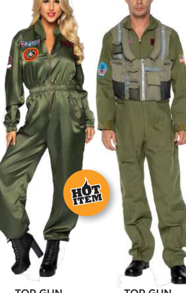
TOP GUN VEST