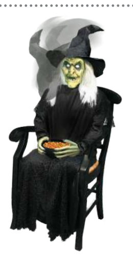
SITTING WITCH Life Size. Animated