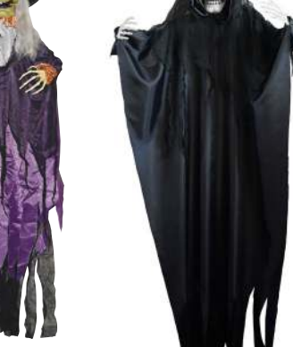
HANGING REAPER 6 Ft. Animated

THRASHING HANGING HANGING TALKING SCARECROW WITCH