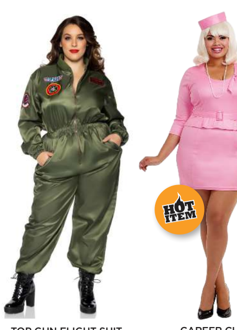
TOP GUN FLIGHT SUIT Plus Size Costume