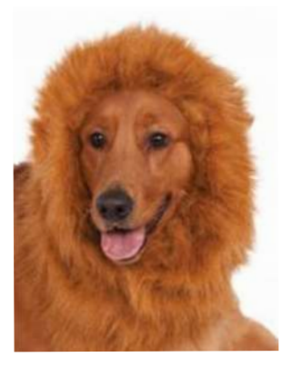
LIONS MANE Dog Costume